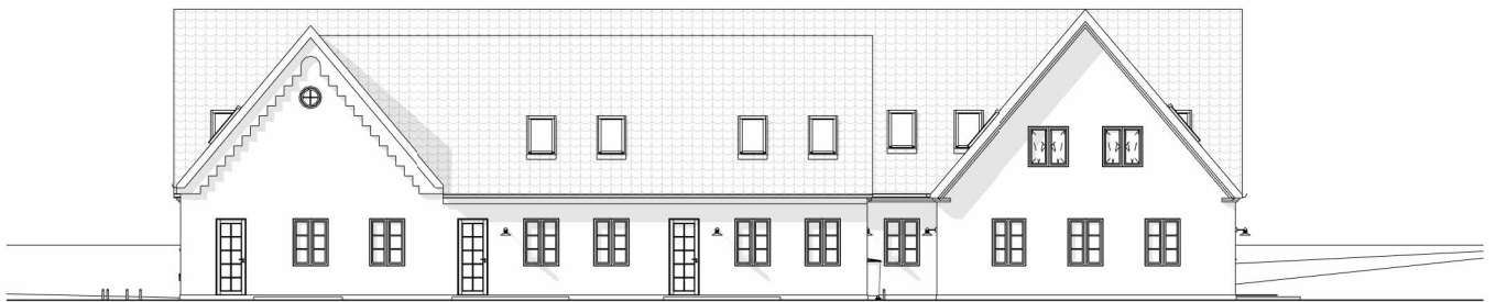
Facade vest 1:250